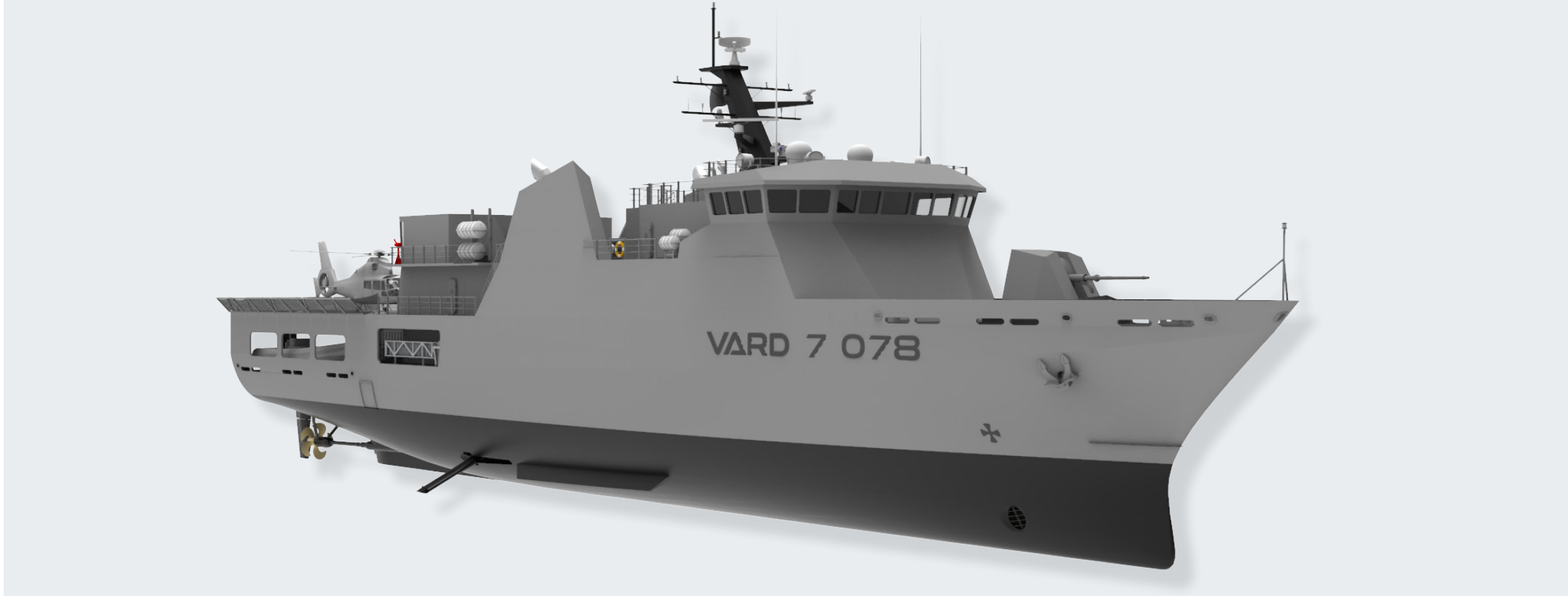
VARD 7 078 OPV Offshore Patrol Vessel