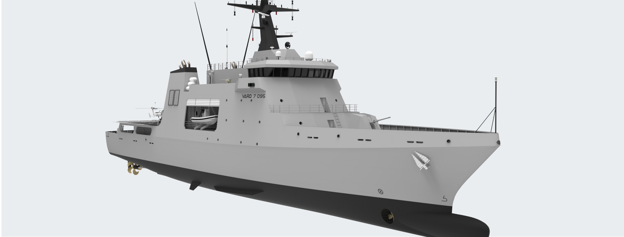
VARD 7 095 Offshore Patrol Vessel