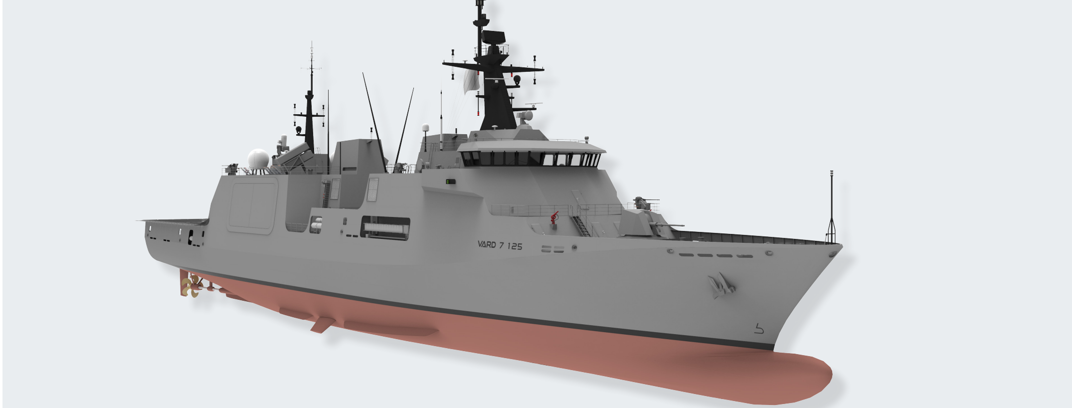
VARD 7 125 NGOPV Next Generation Offshore Patrol Vessel