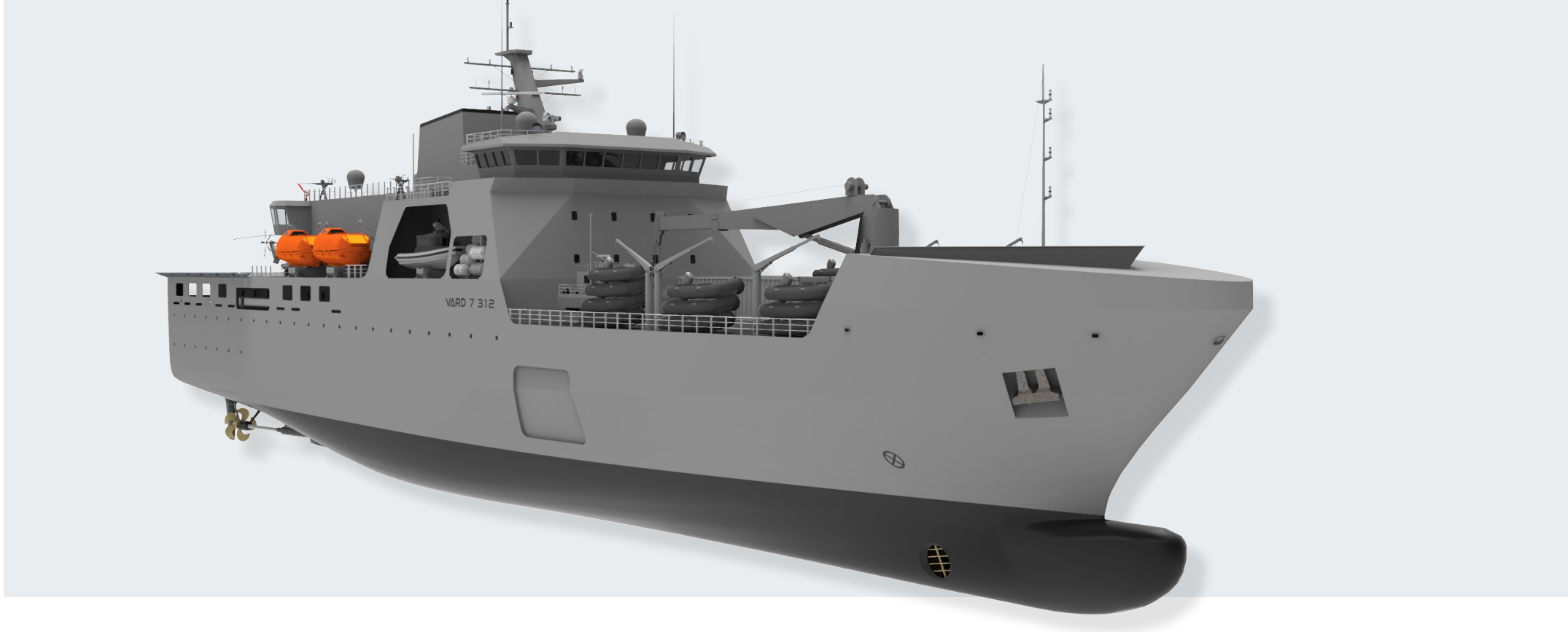
VARD 7 312 MRV Multi-Role Vessel