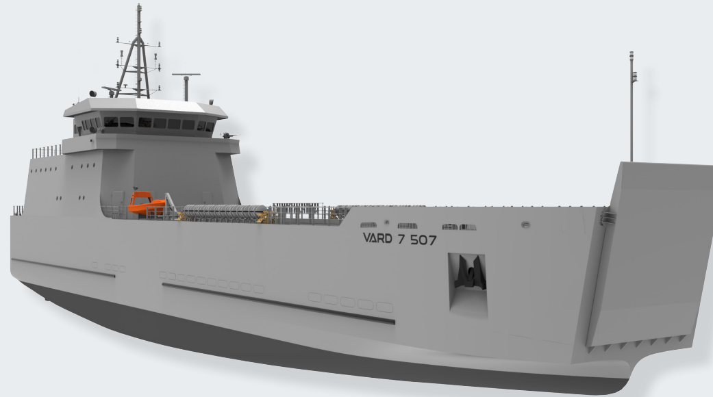
VARD 7 507 Landing Craft Tank