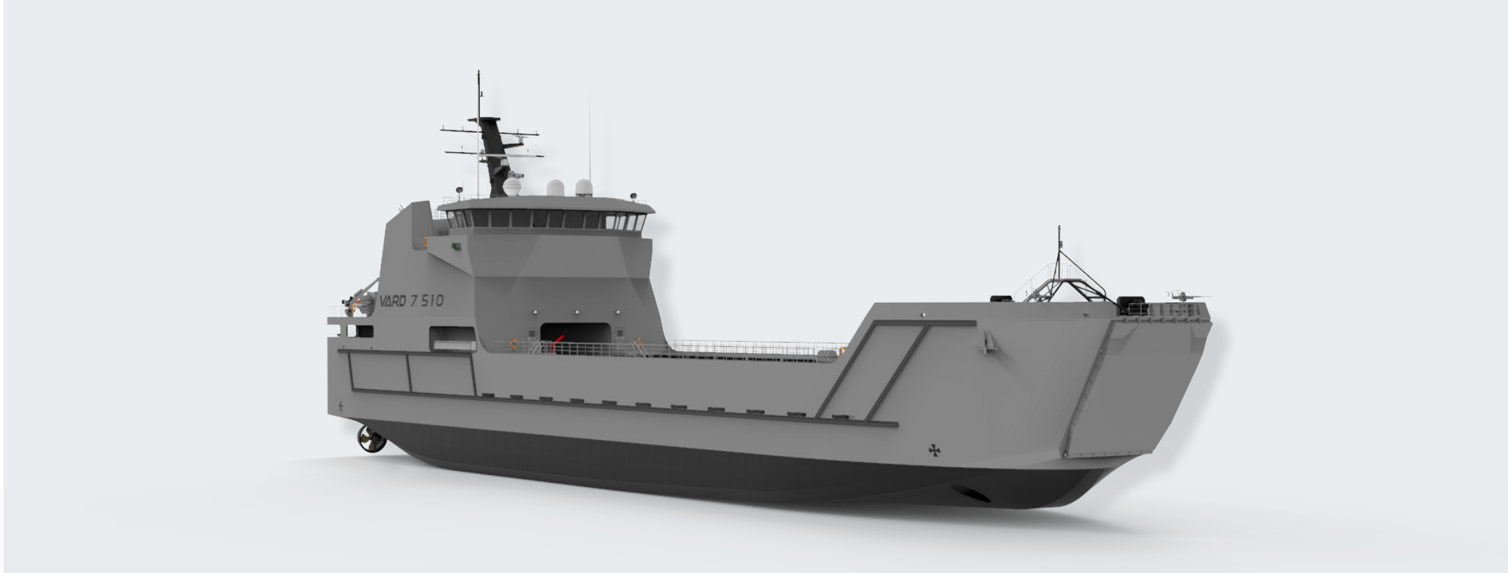
VARD 7 510 LC Landing Craft