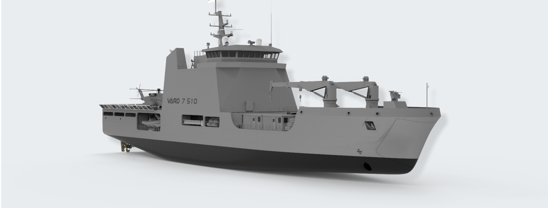
VARD 7 510 LST Landing Ship Tank