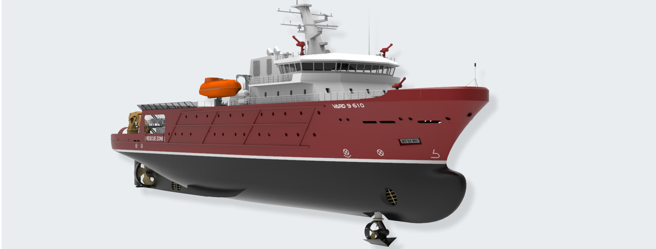
VARD 9 610 ETV Emergency Towing Vessel